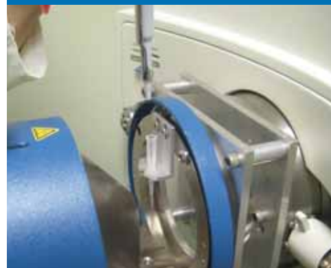
Eject DIP-it sample into Self-Aligning Positioner