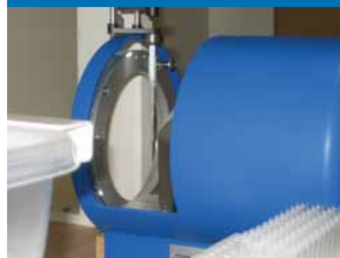
High Throughput Analysis with AutoDART