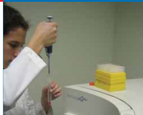
Manual Sampling Using Your Pipettor

DIP-it Samplers Enable Improved Positioning of Samples for Quantitative Analysis