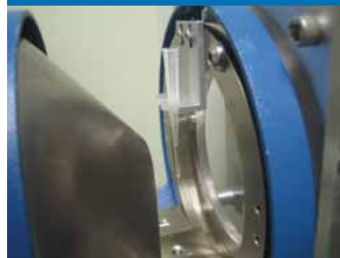
Optimum Sample Desorption Occurs in Seconds