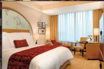
Renaissance Shanghai Pudong Hotel