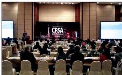
CPSA Shanghai Symposia

New to CPSA Shanghai is a parallel symposia format, providing attendees with even more options to meet their fields of interest.